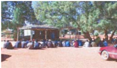
Men at morning Men's meeting