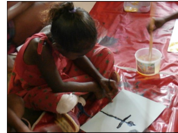
Young Artists at work! Subject "Easter"