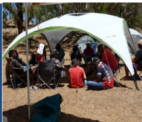
Men's yarning circle. Sharing life stories and being God's men!