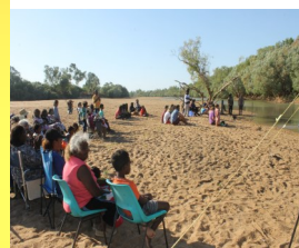
After Communion people gathered at water hole to witness baptism of two men from Normanton.